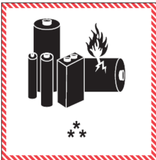
Lithium Battery Mark

Shipments from Utimaco warehouses that contain lithium-metal batteries are labeled with the appropriate label.