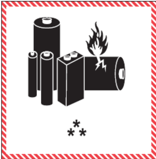
Lithium Battery Mark

Shipments from Utimaco warehouses that contain Lithium Metal Batteries and Lithium Ion Batteries are labeled with the appropriate label.